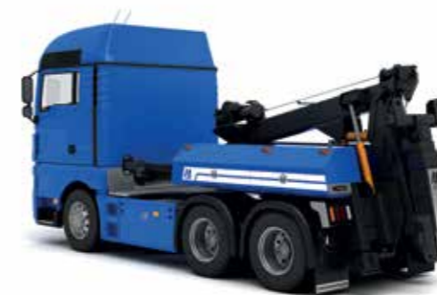
Metro DTU-20 mounted on European highway tractor